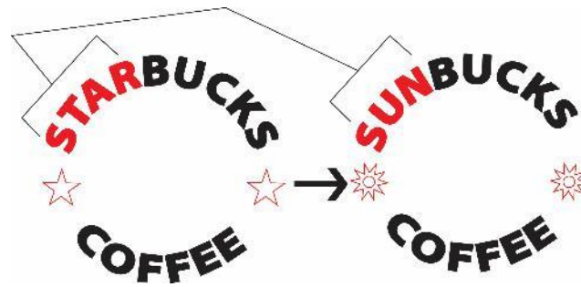
Figure No. (4) Structural analysis of the form of the original letters and shapes used in imitation. (The work of the researcher).