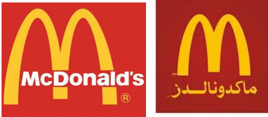
Image No (6) of the original tag https://www.wazifa2day.com/2021/09/Job-McDonalds.html